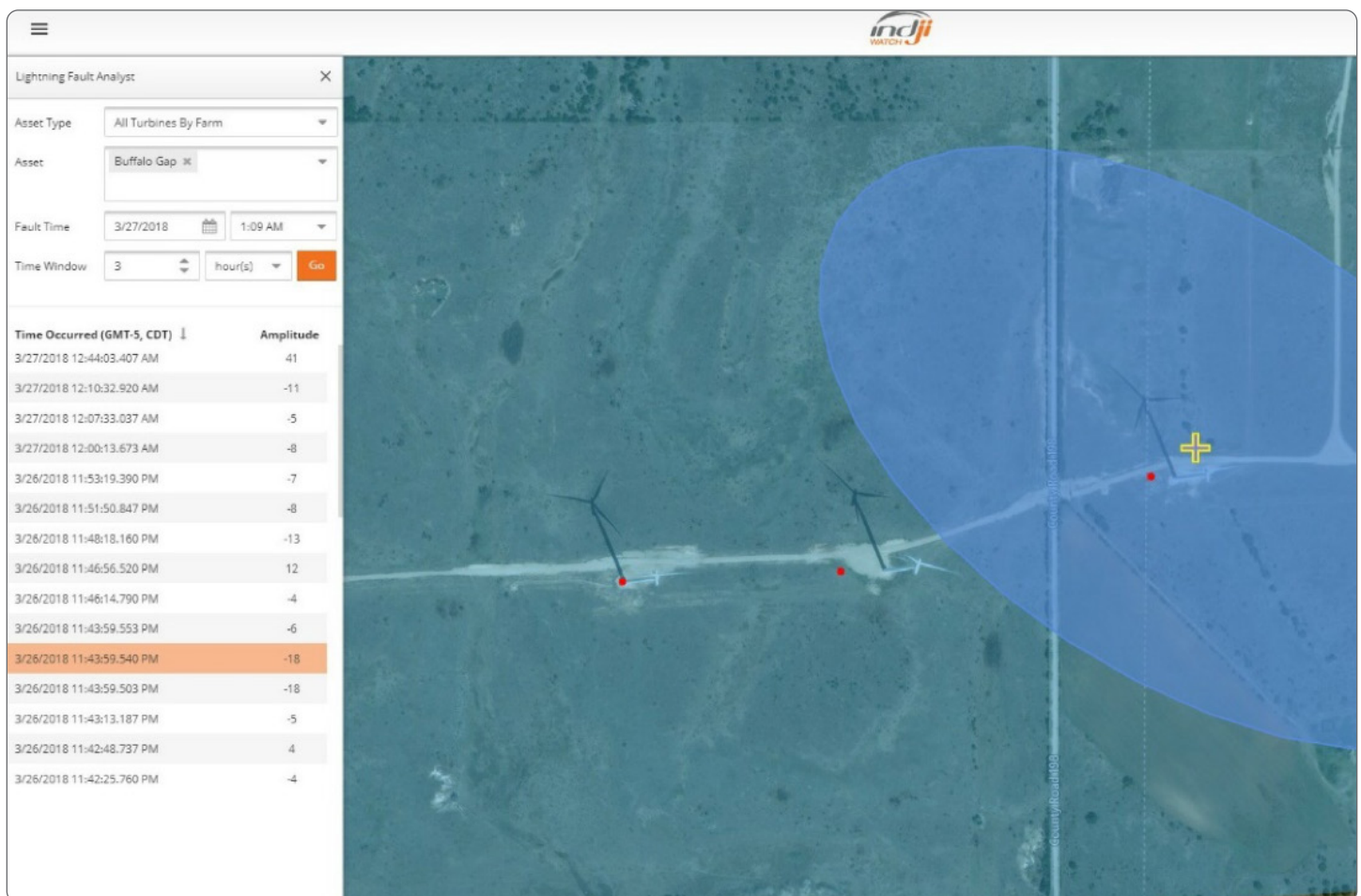
Detailed analysis for strike location.